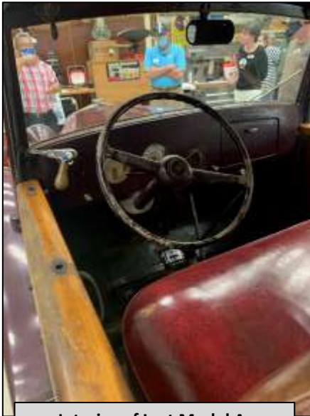
Interior of Last Model A.