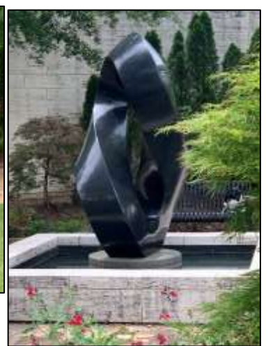
Jule Collins Smith Museum grounds