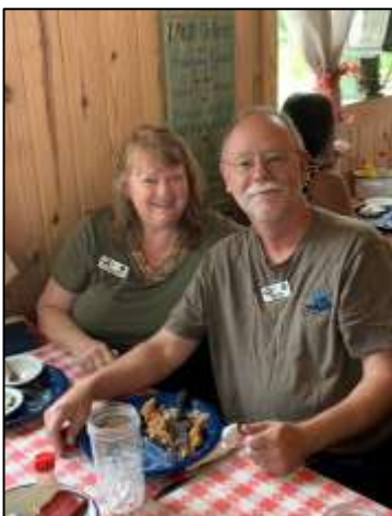
Our Tour Guide and lead driver.