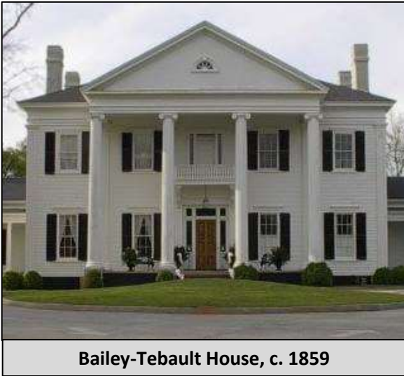
Bailey-Tebault House, c. 1859

(Preceded by lunch at Barnstormer's Grill)